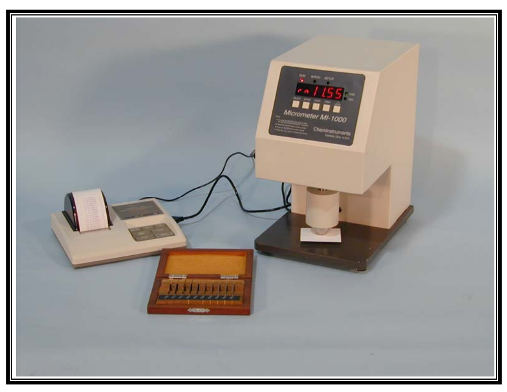
Photo 1 – MI-1000 Micrometer with optional Printer and Calibration Gage Block Set.